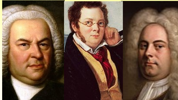
J S Bach / Schubert / Handel

Music by two giants of the Baroque frame that by the great Romantic, Franz Schubert. Bach's Cantata 192 Nun Danket , based on the tune we know as Now thank we all our God and Schubert's charming Mass in G are followed by Handel's stirring Chandos Anthem The Lord shall arise , all with a professional soprano soloist and orchestra.