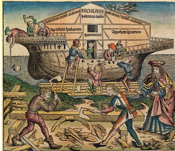
from the 15th Century Nuremberg Chronicle

A concert on the lighter side, with Captain Noah and his Floating Zoo by Michael Flanders and Joseph Horowitz and songs about tempests, ships and animals.