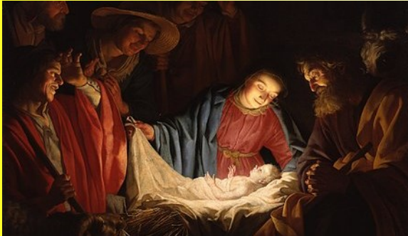
Gerard van Hornhorst Nativity 1622

Beginning with Marc-Antoine Charpentier's Messe de minuit de Noël , music for the night of the Nativity includes carols and the cantata Der Herr ist mit mir by Bach's mentor Dietrich Buxtehude before the arrival at dawn of the Shepherds singing the Sanctus of the Missa Brevis by contemporary Czech composer Jiří Pavlica.