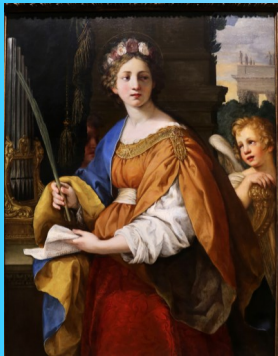
Pietro da Cortana

Bollington Arts Centre Wellington Road SK10 5JR